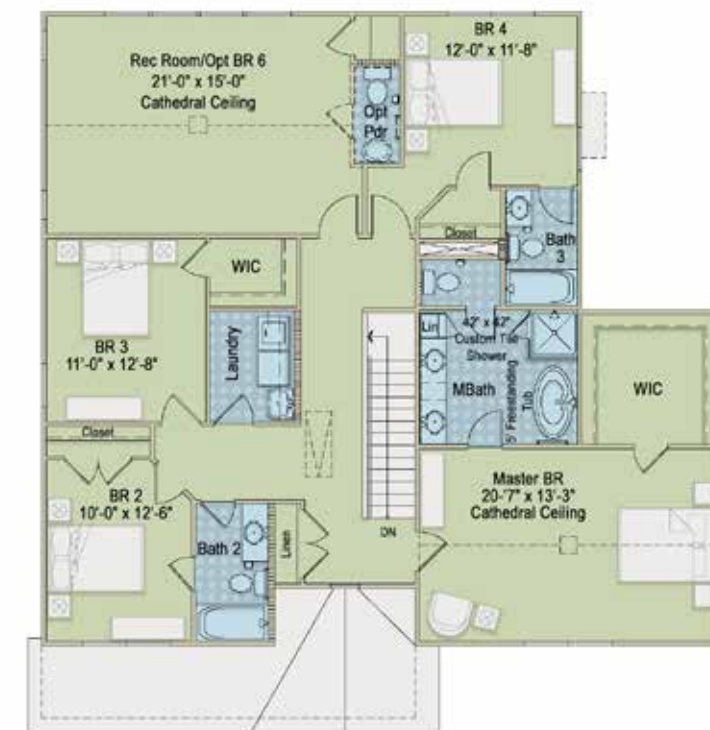
2 ND FLOOR ~3,171 SQUARE FEET