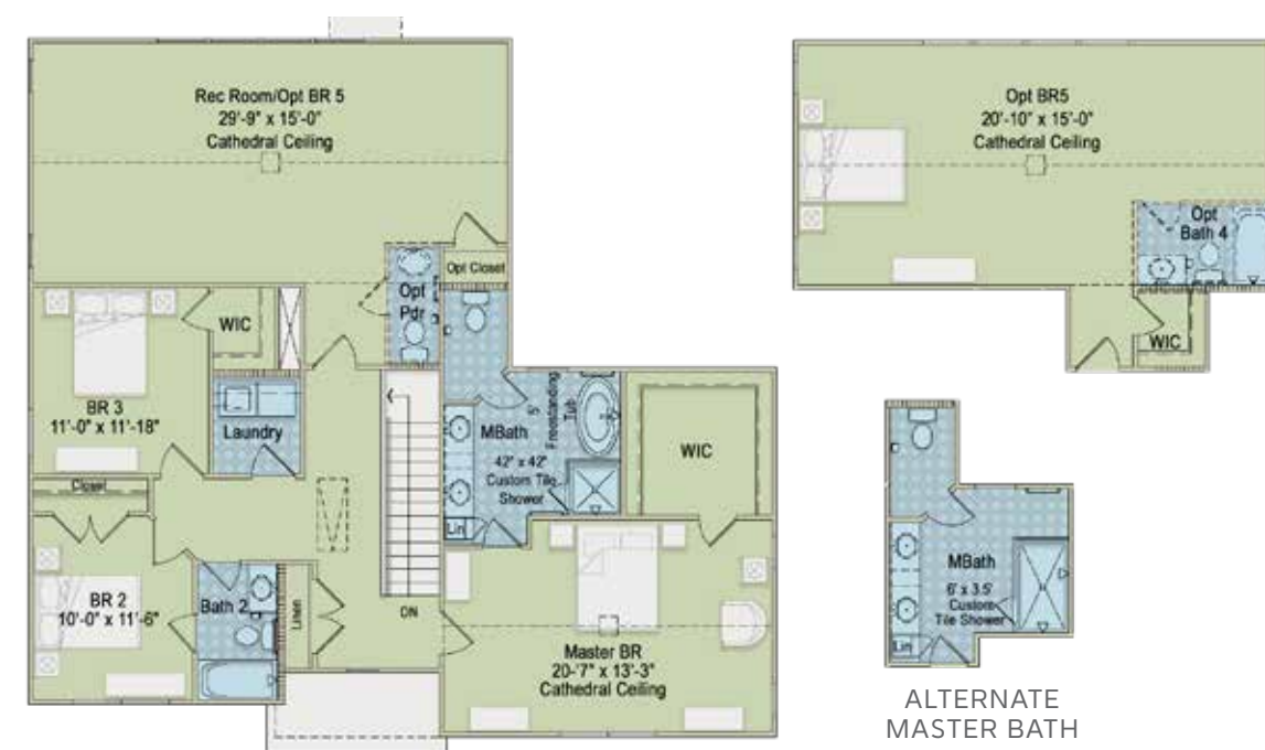
2 ND FLOOR ~2,805 SQUARE FEET W/ BASEMENT ~3,540 SQUARE FEET