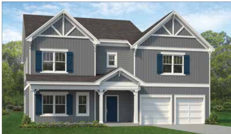
MODERN FARMHOUSE EXTERIOR DESIGN