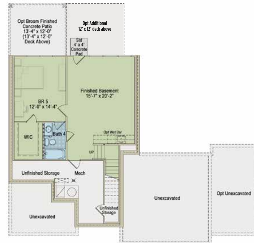
BASEMENT ~735 SQUARE FEET