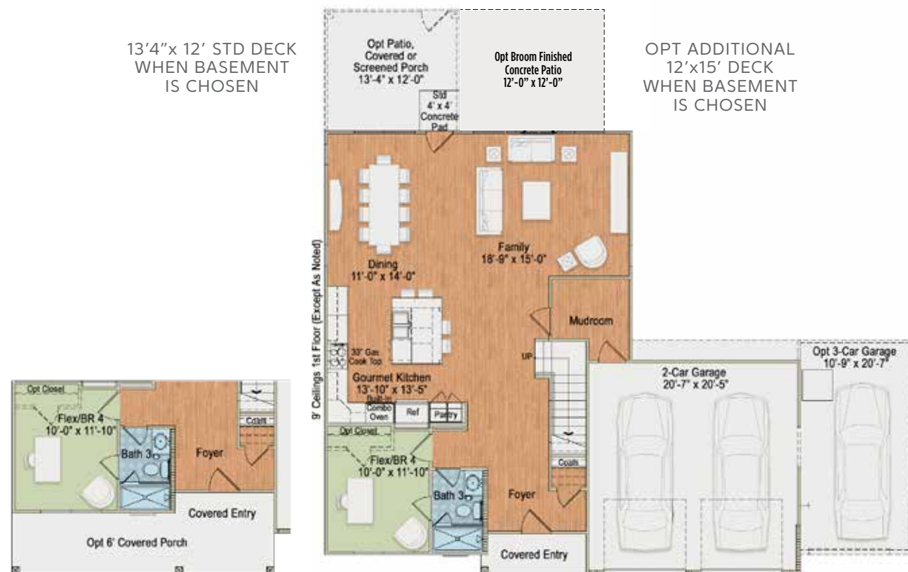
BASE FLOOR PLAN 1 ST FLOOR ~2,805 SQUARE FEET W/ BASEMENT ~3,540 SQUARE FEET