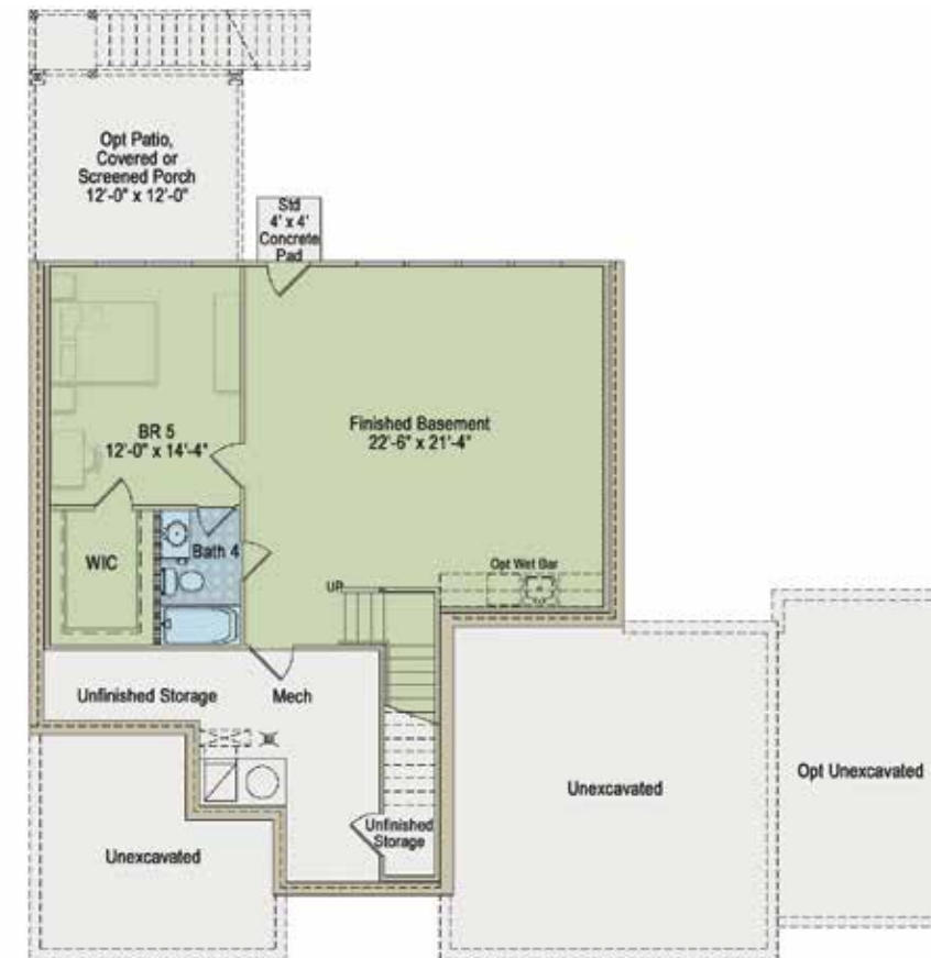
BASEMENT OPTION ~892 SQUARE FEET