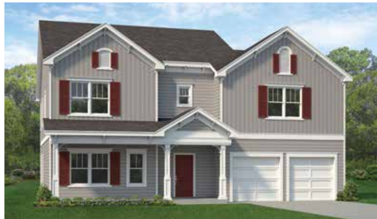
FOLK VICTORIAN EXTERIOR DESIGN