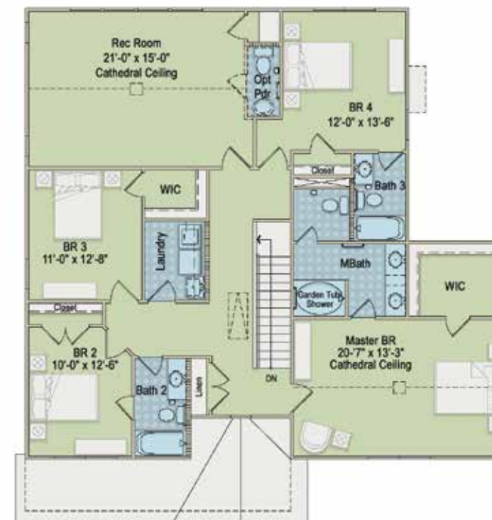
2 ND FLOOR ~3,152 SQUARE FEET