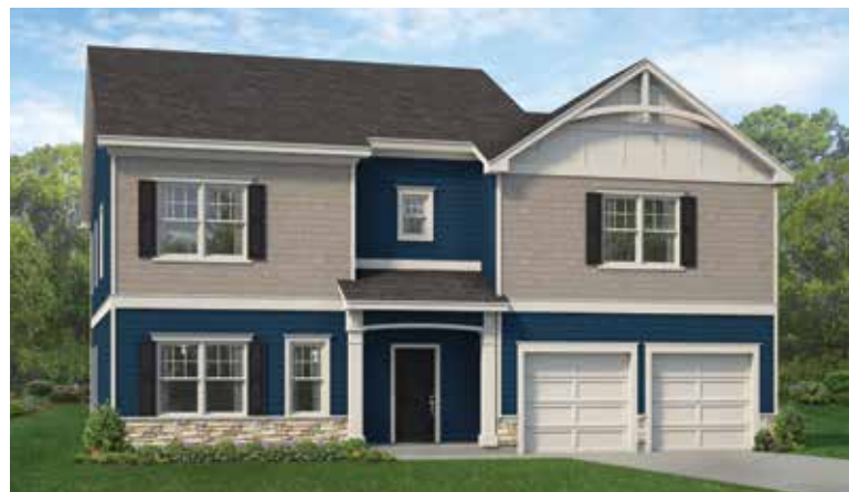
GERMAN COTTAGE EXTERIOR DESIGN