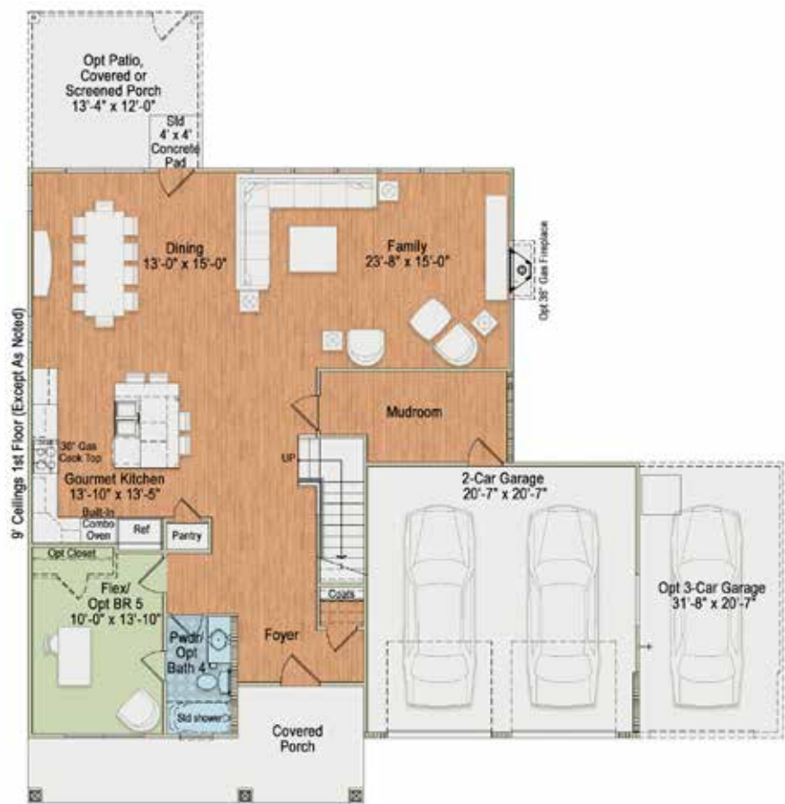
1 ST FLOOR: ~3,152 SQUARE FEET W/ BASEMENT ~4,044 SQUARE FEET