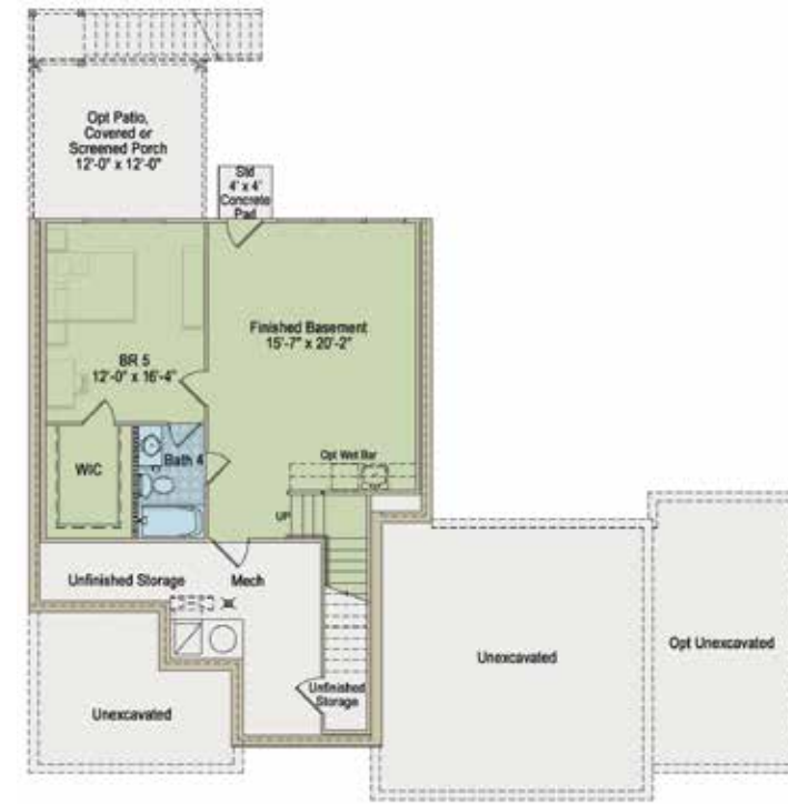
BASEMENT – EXTENDED (REQUIRES 2 ND FLOOR REC ROOM OR BEDROOM #5) ~757 SQUARE FEET