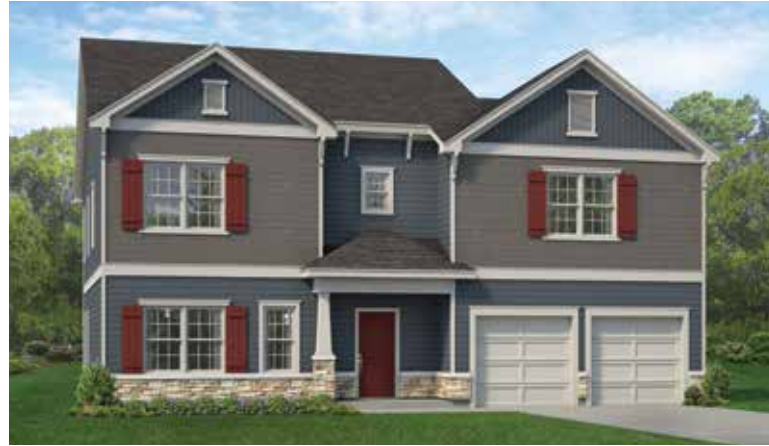
RUSTIC EXTERIOR DESIGN