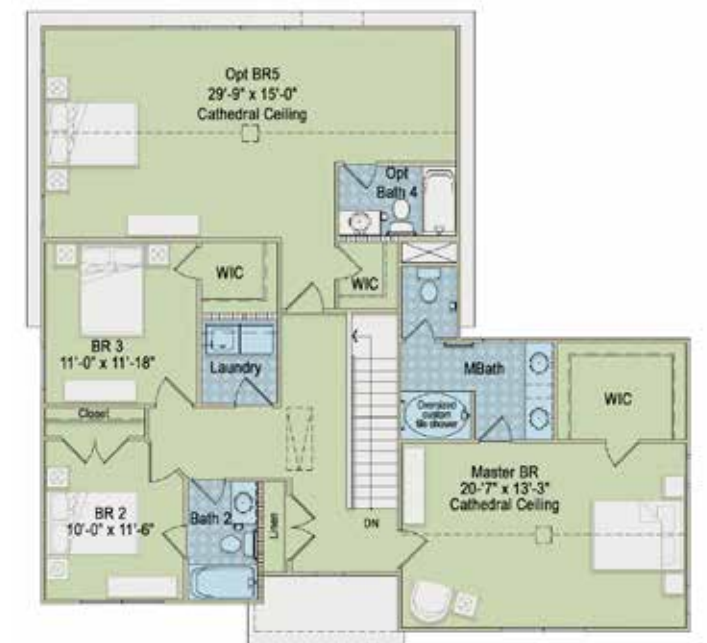
2 ND FLOOR W/ OPTIONAL BEDROOM #5 ~2,772 SQUARE FEET W/ BASEMENT ~3,529 SQUARE FEET