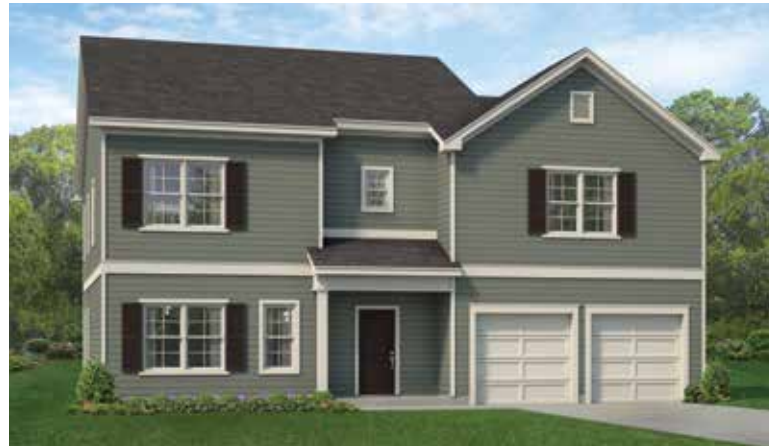
TRADITIONAL EXTERIOR DESIGN