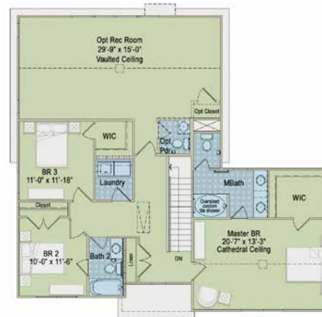
2 ND FLOOR W/ REC ROOM ~2,772 SQUARE FEET W/ BASEMENT ~3,529 SQUARE FEET