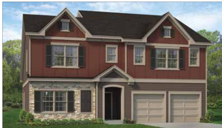
ENGLISH EXTERIOR DESIGN OPT. REC ROOM AND BEDROOM 5/6