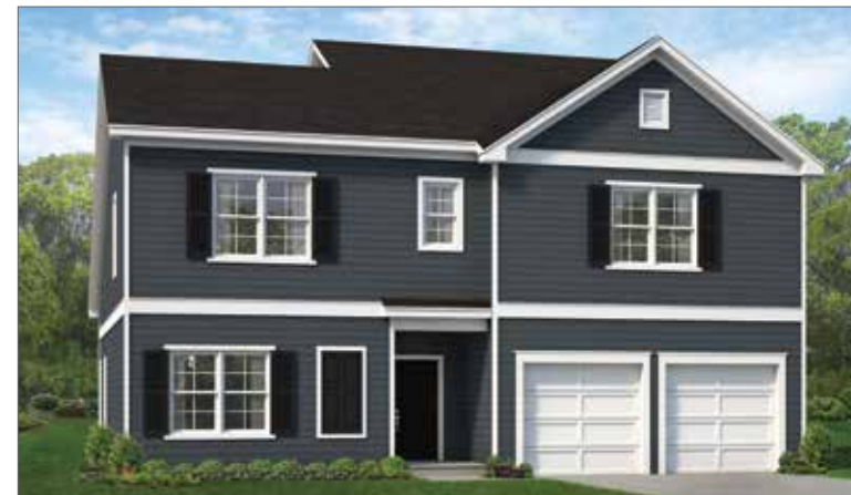
TRADITIONAL EXTERIOR DESIGN OPT. REC ROOM AND BEDROOM 5/6