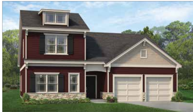
CRAFTSMAN EXTERIOR DESIGN STANDARD