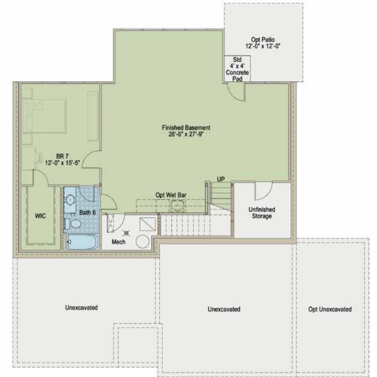
BASEMENT ~1,096 SQUARE FEET