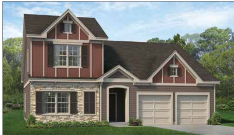
ENGLISH EXTERIOR DESIGN STANDARD