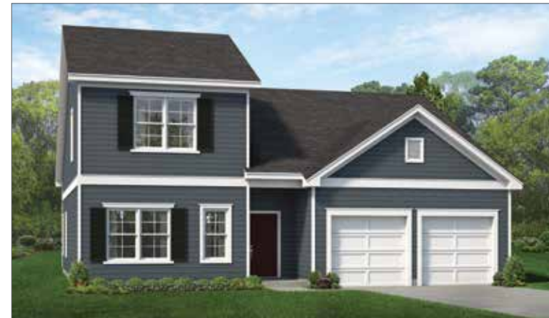
TRADITIONAL EXTERIOR DESIGN STANDARD