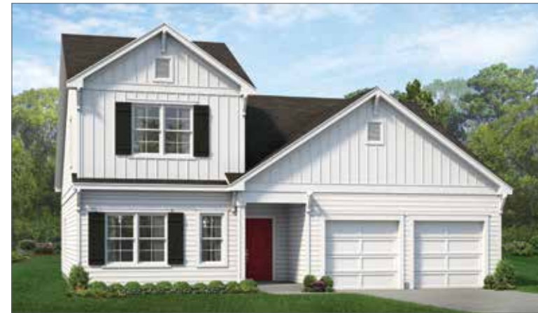
FARMHOUSE EXTERIOR DESIGN STANDARD