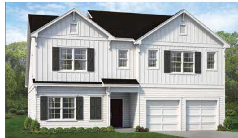
FARMHOUSE EXTERIOR DESIGN OPT. REC ROOM AND BEDROOM 5/6