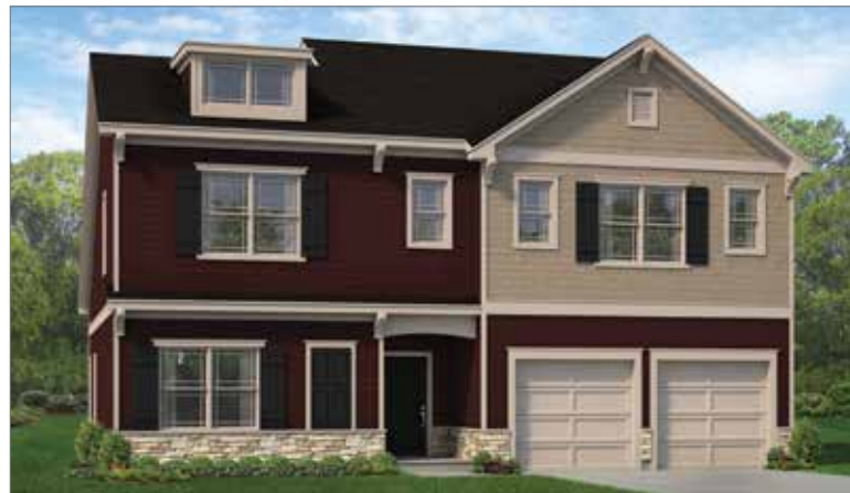
CRAFTSMAN EXTERIOR DESIGN (OPT. REC ROOM AND BEDROOM 5/6)